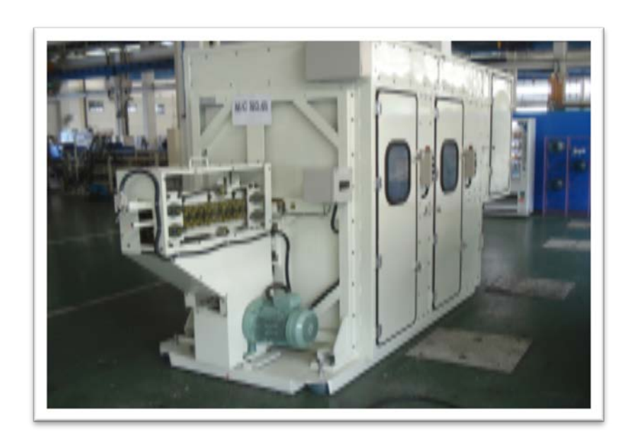
HOSE BRAIDING MACHINE