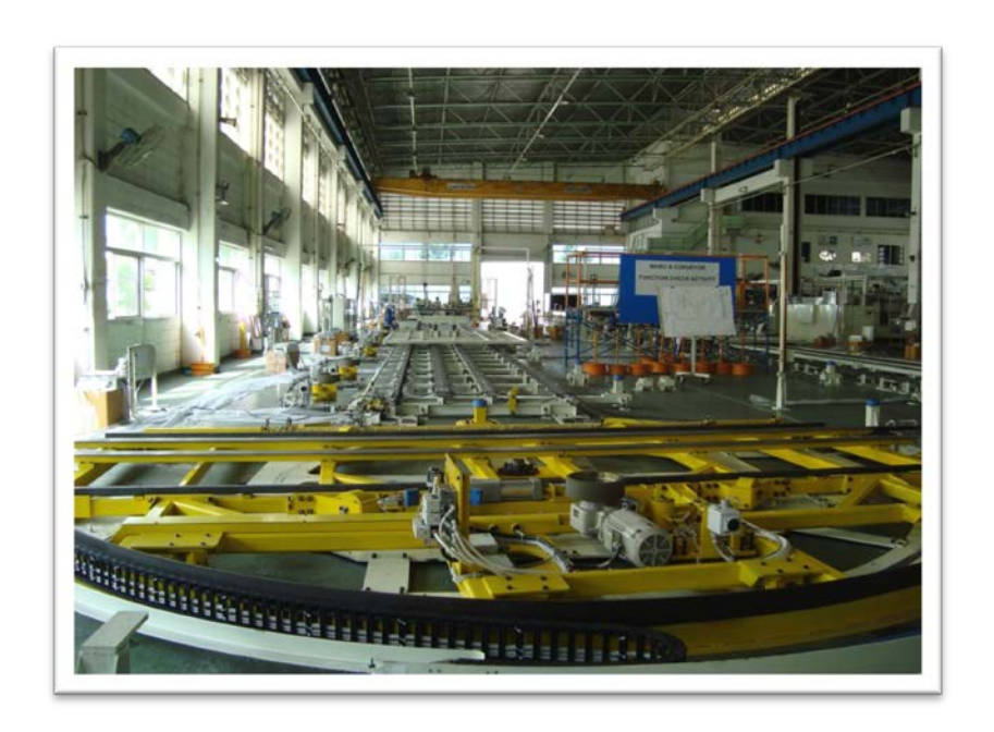
ASSEMBLY LINE COVEYOR